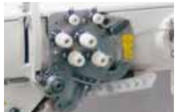
*This function can be applied only for head with AK/BT/DL.

The material can be sewn with the most-suitable thread tension according to its weight. Light-weight materials are sewn with the single tension mode and heavy-weight sections of the material are sewn with the double tension mode. The thread tension mode can be changed over with ease by means of a switch.